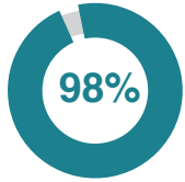
INCREASED TESTIMONY OF THE GOSPEL OF JESUS CHRIST