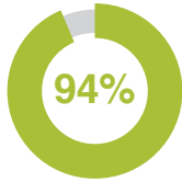
IMPROVED PERSONAL PRAYER